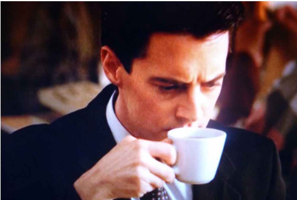
Figure 4: Agent Cooper at the Double R Diner

Heterotopias are informed by the transgressions of their boundaries, by the enunciations they encourage and the contradictions they incite. We can see their effects everywhere we choose to look, but the question is whether we will so choose. (Dumm, 2002: 46)