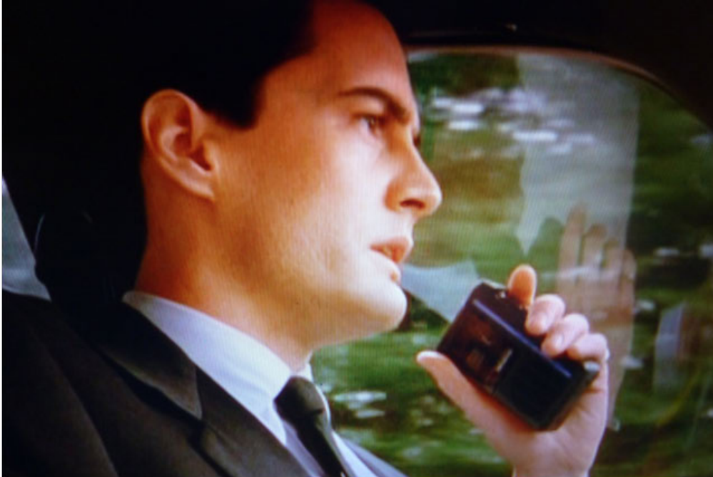
Figure 1: Agent Cooper driving into Twin Peaks 3

characters and ‘supernatural’ overtones (Hewitt, 1986/2009). 2 Before we analyze TP’s ‘city of absurdity’ in more detail, we discuss below the Foucauldian concept of heterotopia. It will serve as an analytical lens in our exploration of TP’s sites of (other) organizing.